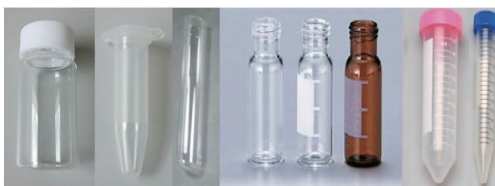
5ml vial, microtube, micro test tube, 1.5ml / 2ml vial, Sample vial for HPLC, falcon tube / conical tube etc...

Tapered Spiral Plugs are compatible with more than 500 different containers such as vials and micro tubes etc.